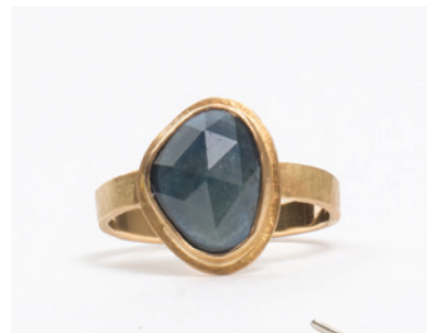
Above clockwise: CERAMIC FLASK ($95) BY CHARLIE BARMONDE (page 46); SOUTH SEA TAHITIAN PEARL WITH SAPPHIRE, TOURMALINE & SILLIMANITE LOOP CASCADE PENDANT ($1,250) ON 14K PINK GOLD 24" CHAIN ($925) BY TIFFANY PEAY JEWELRY (page 41); SEA GREEN TOURMALINE EARRINGS CLAW SET IN RECYCLED 14K GOLD ($585); ATLANTIC BLUE SAPPHIRE RING: ETHICALLY-SOURCED SAPPHIRE BEZEL SET IN RECYCLED 18K GOLD BY HARMONY WINTERS (page 47); SEAGLASS JEWELRY BY LITA SEA GLASS JEWELRY (page 49)