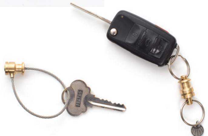
Right: KEYCHAINES ($60-85) BY DESIGN WORKS STUDIO (page 47)